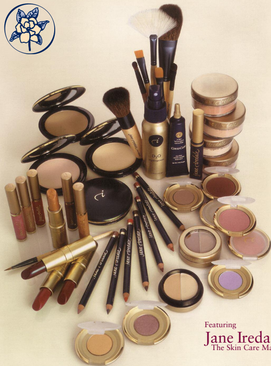
Featuring Jane Iredale The Skin Care Makeup