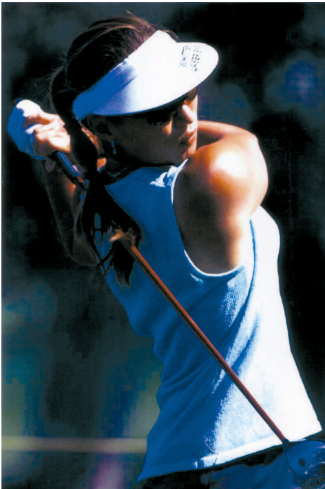
Pearl Sinn Bonanni - LPGA Pro

You wouldn't think dirt and grass stuck to your club face could hurt your game, but they do. Even grains of sand can change the flight of the ball when you hit it. That little change at the tee makes a big difference where your ball lands on the green. A clean club face can improve the accuracy of your shot.