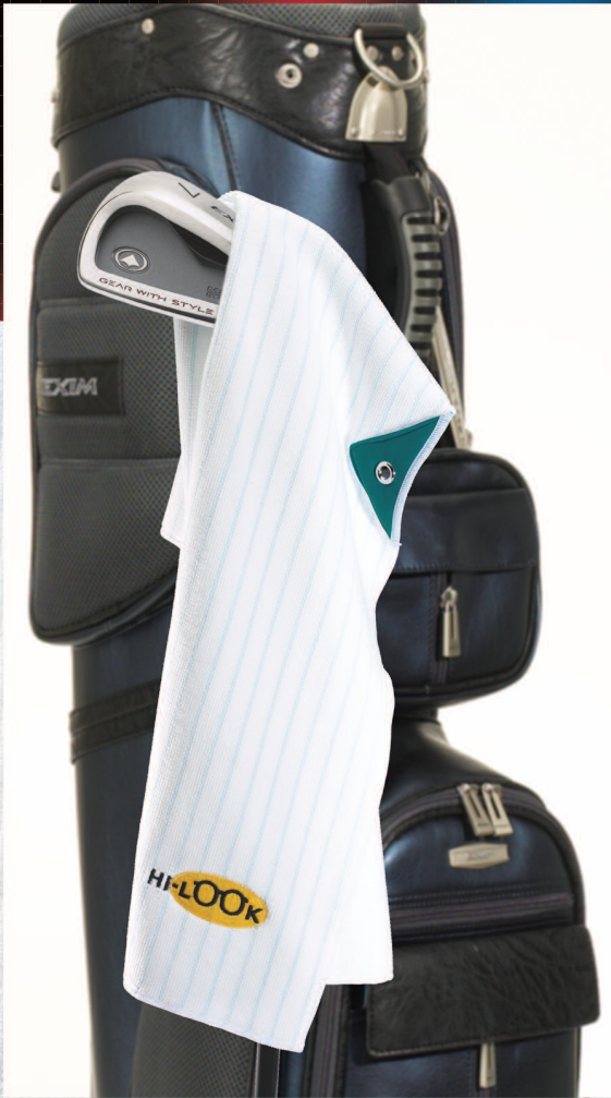
Hang the Hi-Tech Golf Towel from your golf club bag.

Scrub and clean your clubs with Hi-Tech dual element front layer.